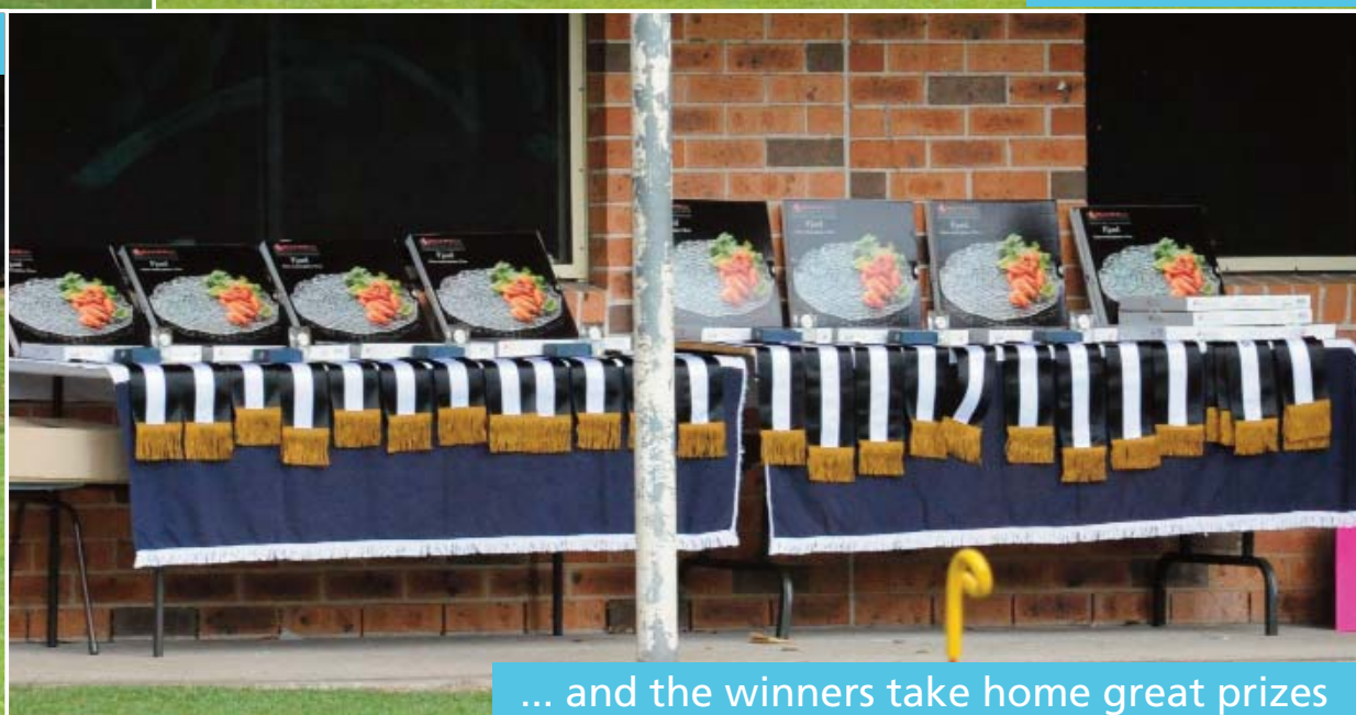
... and the winners take home great prizes