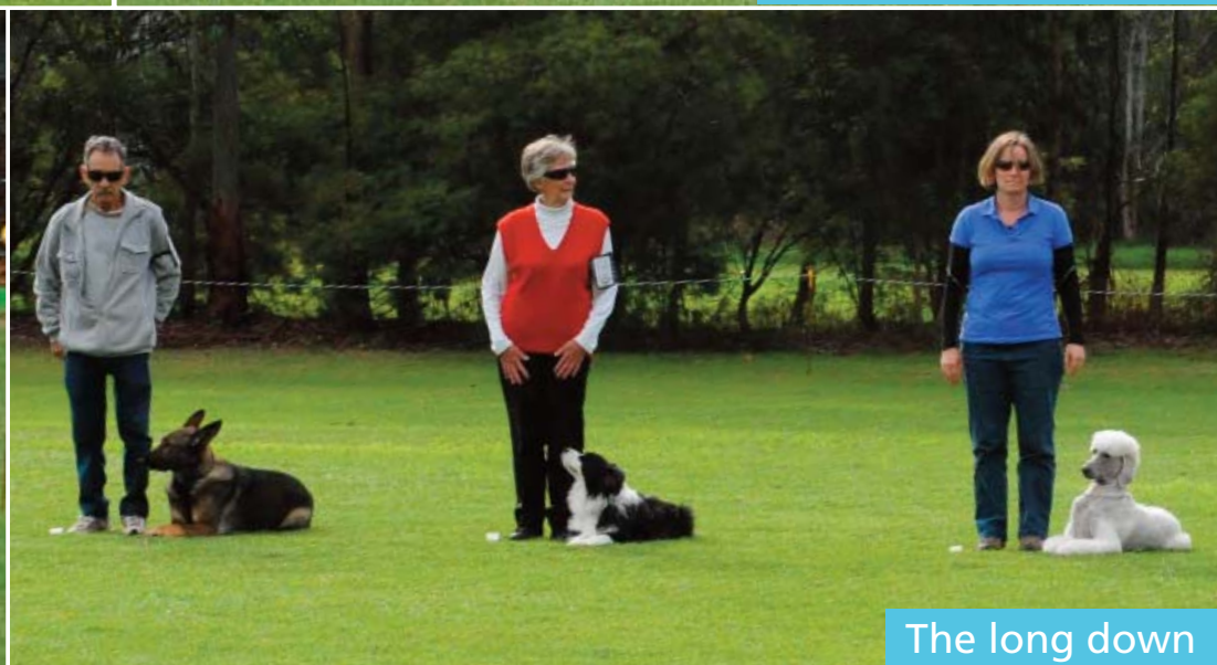
The long down