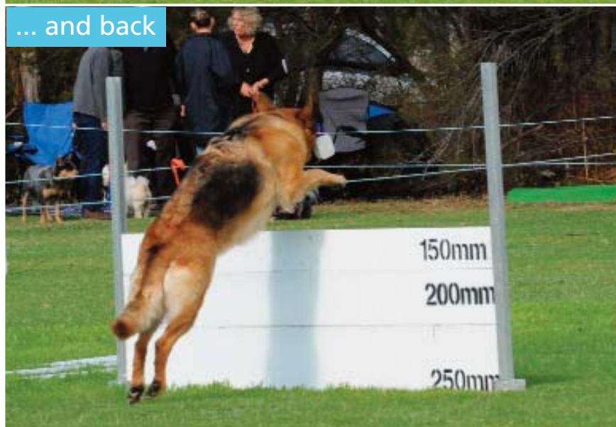
... and back