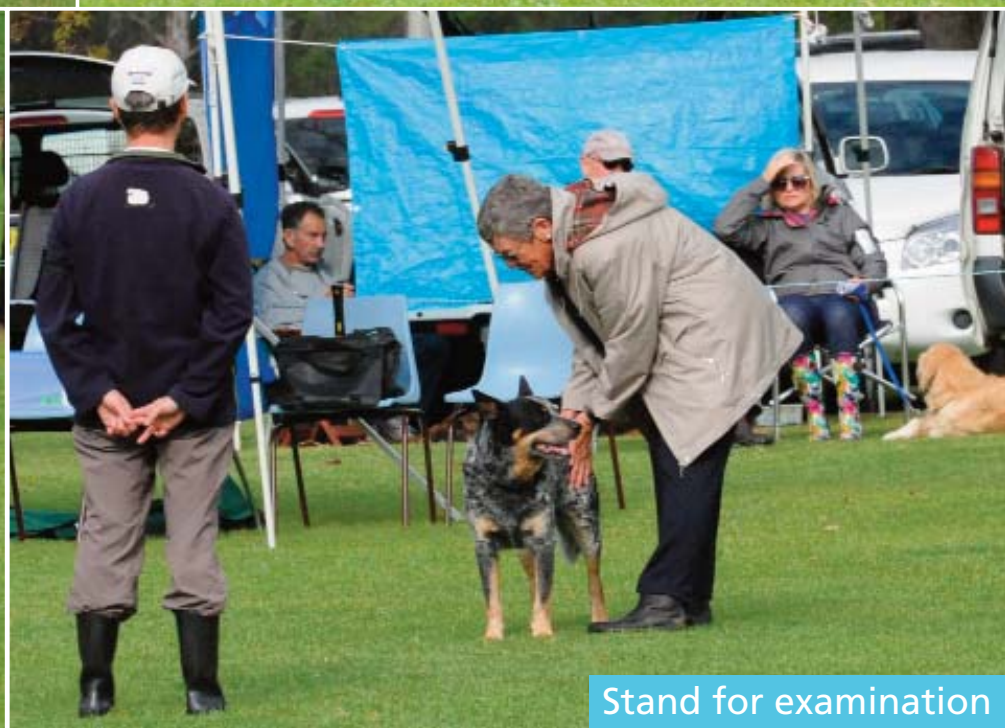
Stand for examination