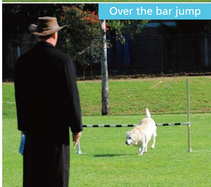
Over the bar jump