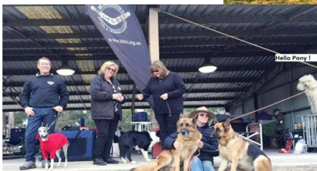
Hello Pony !