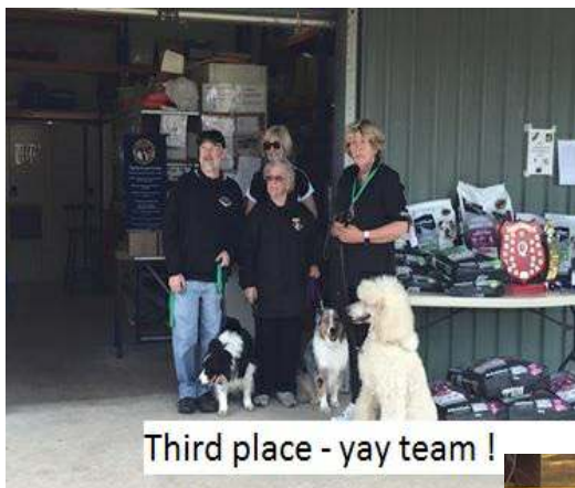
Third place - yay team !