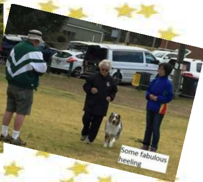
Some fabulous heeling