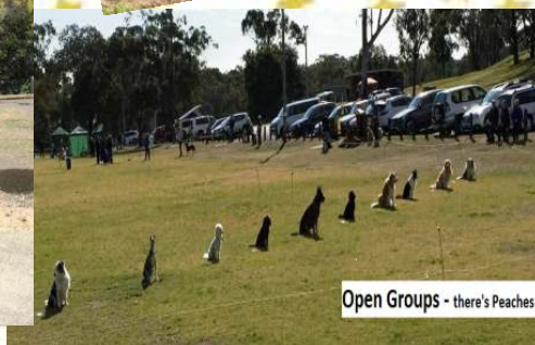
Open Groups - there's Peaches