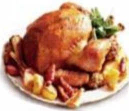
fatty foods & cooked bones