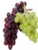
grapes, raisins & sultanas