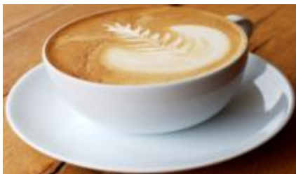
Canteen Service for you and your dog

A Canteen service is available on Tuesday nights at training. We even have treats available for your dogs. We also sell leads and collars, check chains and soft collars. Come and meet the team. They will help you with anything you would like to buy. Also any information you want to know. So before or after training come and say hello.