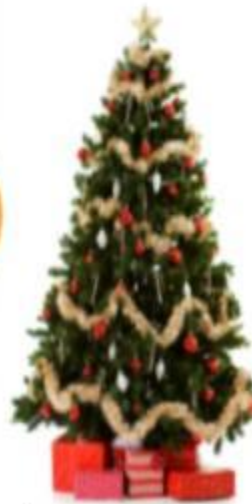
pine needles, tinsel, decorations & lights