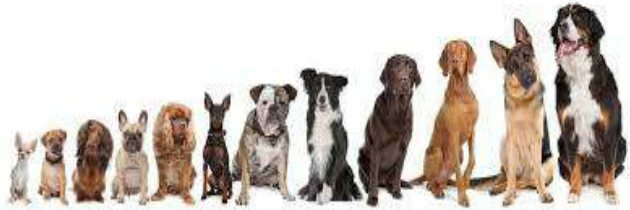
Food refusal - good dog Charlie