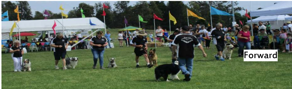
Dog to Dog