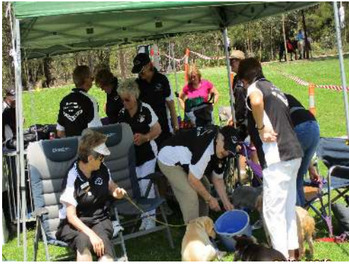
Our busy team