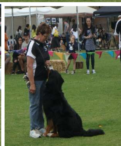
Focus, focus focus