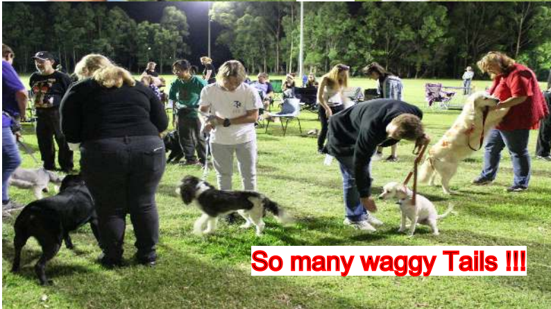
So many waggy Tails !!!