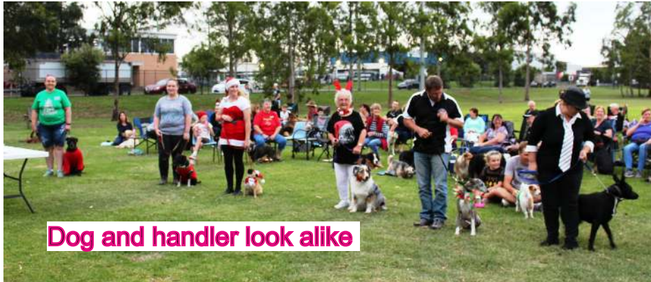
Dog and handler look alike