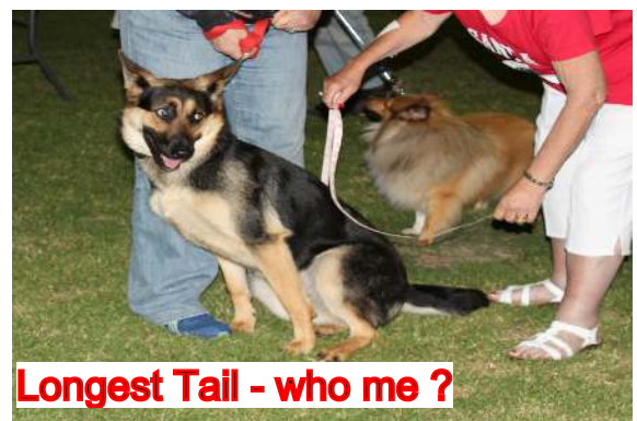
Longest Tail - who me ?