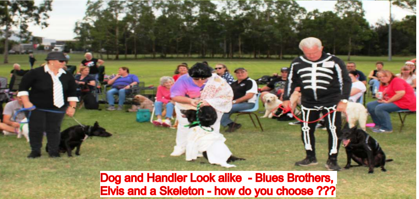
Dog and Handler Look alike - Blues Brothers, Elvis and a Skeleton - how do you choose ???