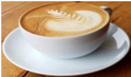
Canteen Service for you and your dog

A Canteen service is available on Tuesday nights at training. We even have treats available for your dogs. We also sell leads and collars, check chains and soft collars. Come and meet the team. They will help you with anything you would like to buy. Also any information you want to know. So before or after training come and say hello.