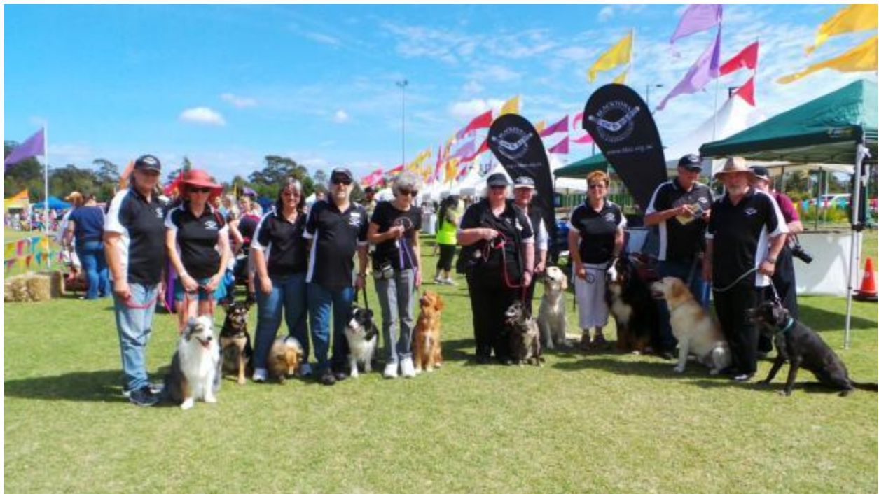
The stars of Pet Festival 2016