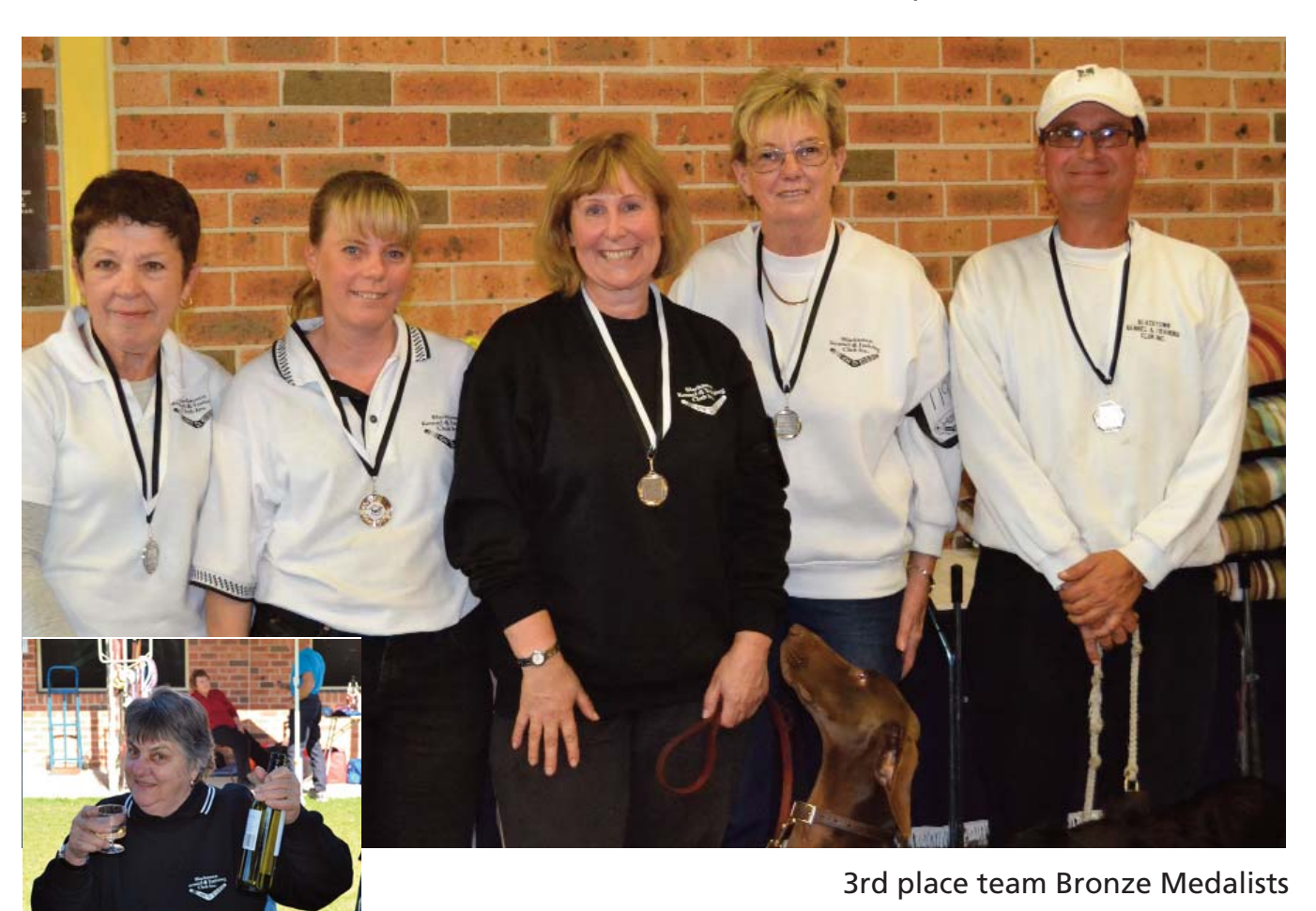
Clearly a glass or two helped stear them to success