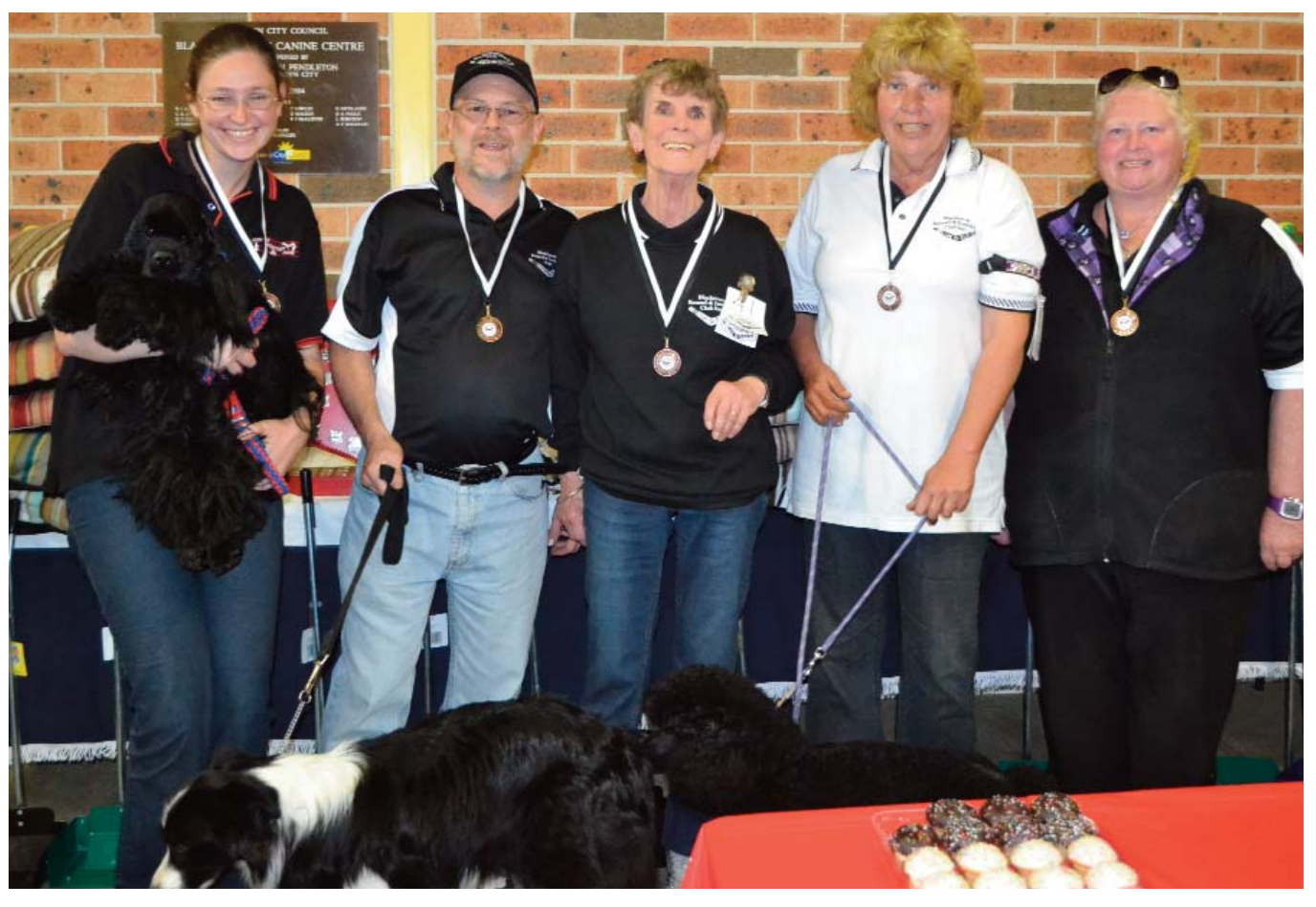
Our 2nd place team Silver Medalists